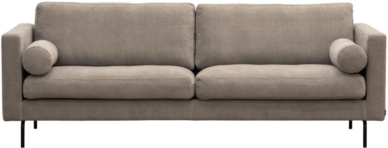
JULIA 11255-09 MIKOTOTO